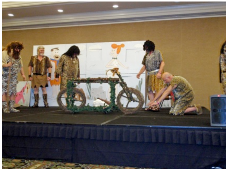
The 2012 Non ABS Goldwing?